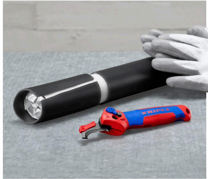
Perfect tool for stripping tough cable sheaths