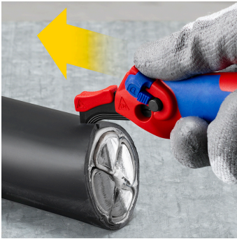
Two blades for pushing or pulling lengthwise cuts