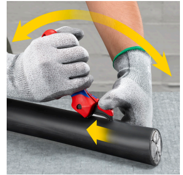
Ratchet function enables stripping with less effort for a variety of larger diameter cable sheaths