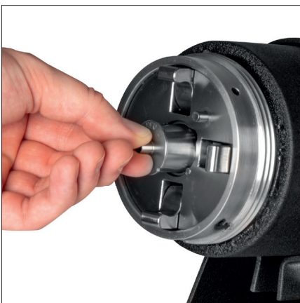
Locator - exact positioning of contact during the crimping process