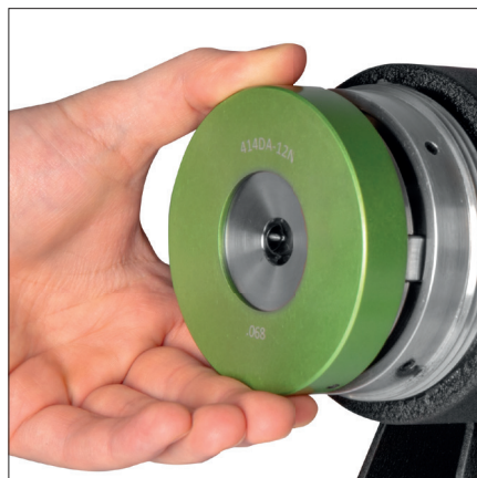
Die sets easily interchangeable with no special tool required