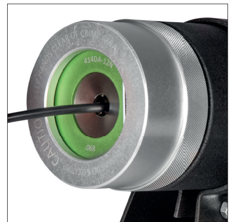
Processing of a variety of crimp styles