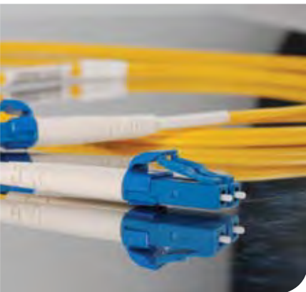
Value Series Fiber Solutions