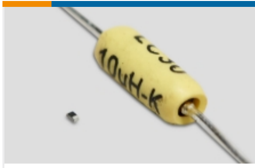
High Frequency & RF Inductors(82)