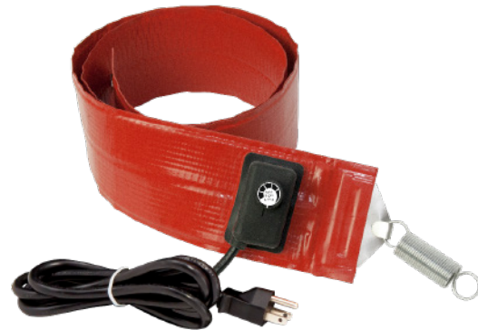
Ideal for a wide range of drum/pail applications