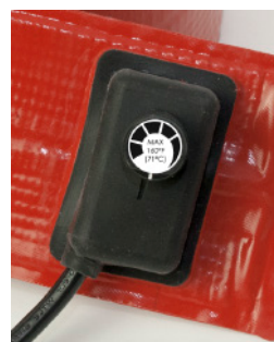
Easy-to-use adjustable thermostat

Heaters should always be placed below fill level of container.