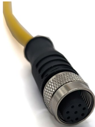
FEMALE FACE VIEW

(M12 Cordset, 8 Position, 24 AWG, Shielded Female Straight to Free End)