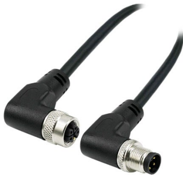
MALE FACE VIEW

(M12 Cordset, 5 Position, 16 AWG Unshielded, Male 90° to Female 90°)