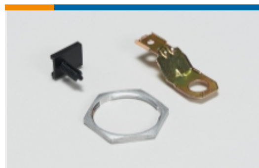
Other Automotive Connector Accessories(1)