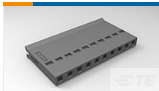
TE Part # 487378-1 002 HOUSING FFC RCPT 100CL SR