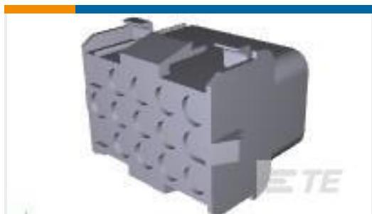
TE Part # 926647-1 BOIT F MNL 15P