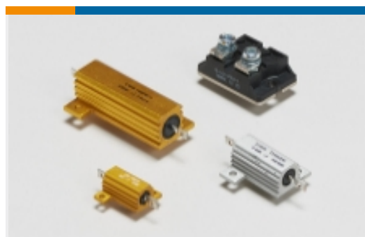
Chassis Mount Resistors(1068)