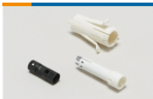
Plug & Socket Lighting Connector Accessories(1)