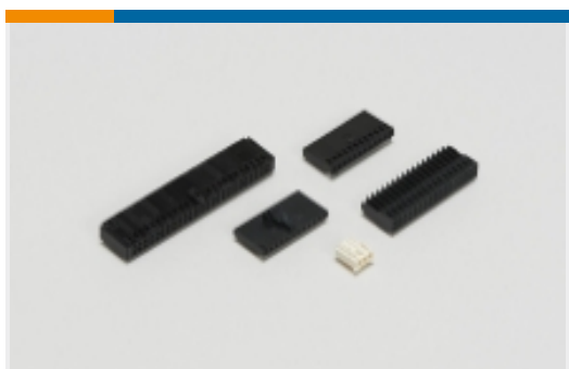
Wire-to-Board Connector Assemblies & Housings(1)