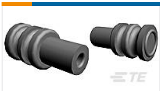
TE Part # 964972-1 EINZELLEITERDICHTNG