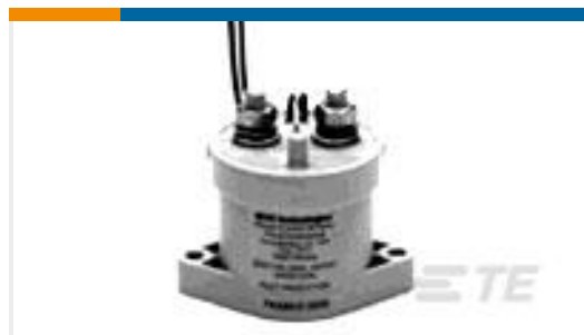
TE Part # 1618002-1 EV200A1ANA=RELAY,UN-ECON EV200