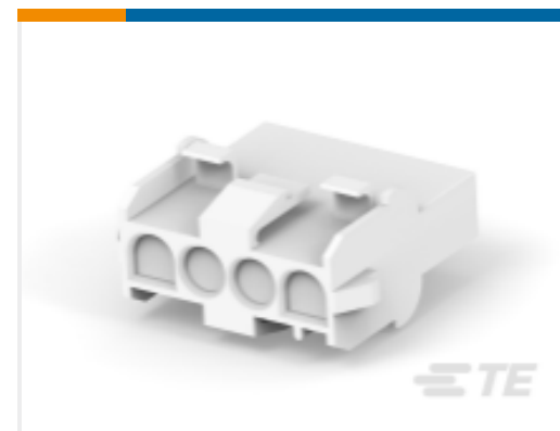
TE Part # 926305-1 4P UNIV M-N-L CAP

Also in the Series | Universal MATE-N-LOK