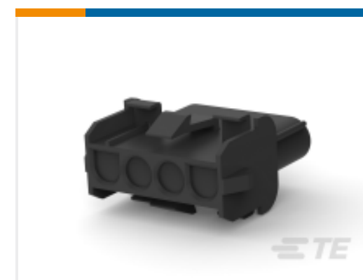
TE Part # 794707-1 04P UMNL CAP HSG, BLACK