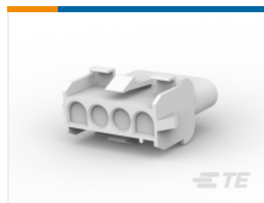
TE Part # 1586845-1 04P UMNL CAP HSG NATL, GW