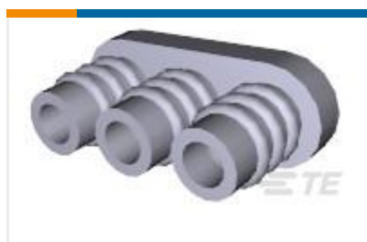
TE Part # 794272-1 03P UMNL WIRE SEAL