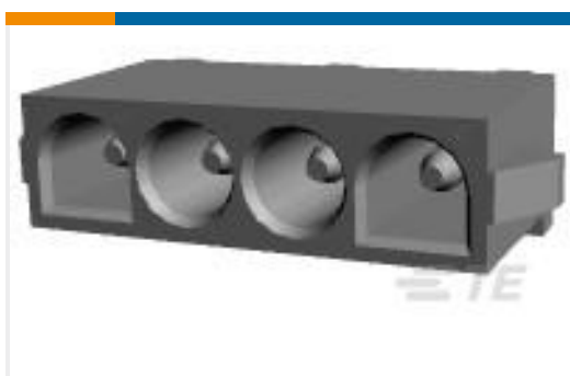
TE Part # 350430-1 04P UMNL PIN HDR ASSY NATL