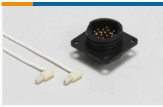
Circular Power Connectors(2)