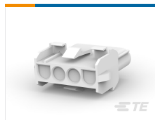
TE Part # 2-480703-0 04P UMNL CAP HSG NATL