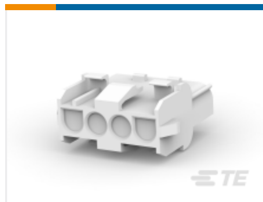
TE Part # 926305-6 UNML4WAY CAP