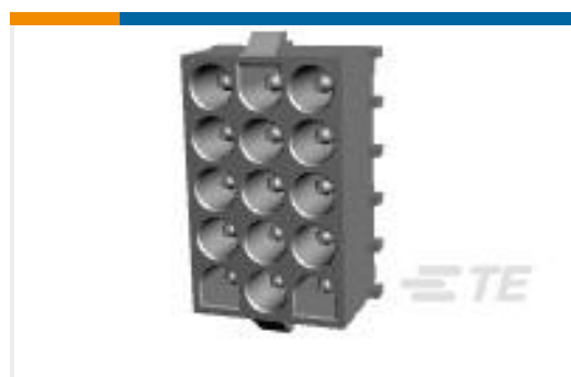
TE Part # 350434-1 15P UMNL PIN HDR ASSY NATL