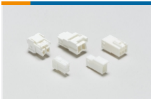
Rectangular Power Connectors(671)