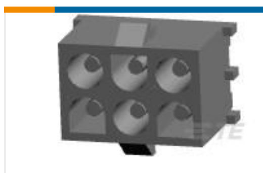
TE Part # 350431-1 06P UMNL PIN HDR ASSY V2 NAT