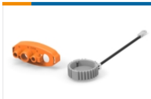
Connector Caps & Covers(34)