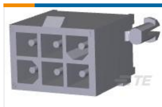
TE Part # 1-770875-0 06P MINI UMNL HDR ASSY SN