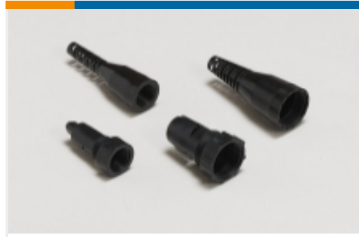
Connector Strain Relief(7)