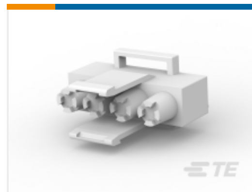
TE Part # 770036-1 04P UMNL II PLUG REAR 94V0