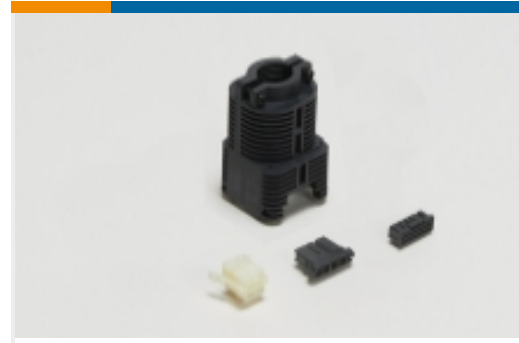
Rectangular Connector Housings(1)