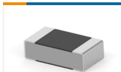
TE Part # 7-1879135-9 RN 0603 7R68 0.1% 10PPM 5K RL