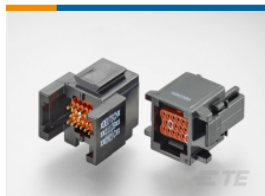
TE Part # ABC03N-22S-4048 IN-LINE RECP