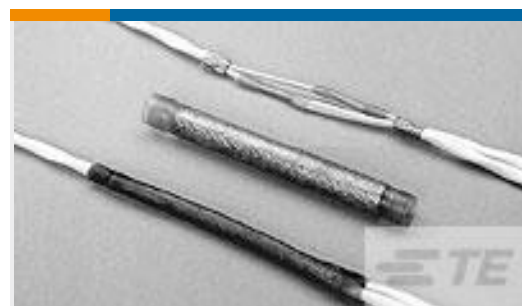
TE Part # 868566-000 D-150-0124