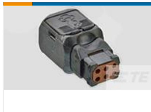
TE Part # D369-P66-NS1 369 6 WAY PLUG, CRIMP, SKT