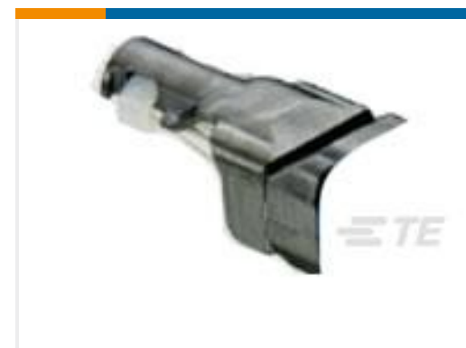
TE Part # D369-STB-6 369 6 WAY BACKSHELL STRAIGHT TIE WRAP