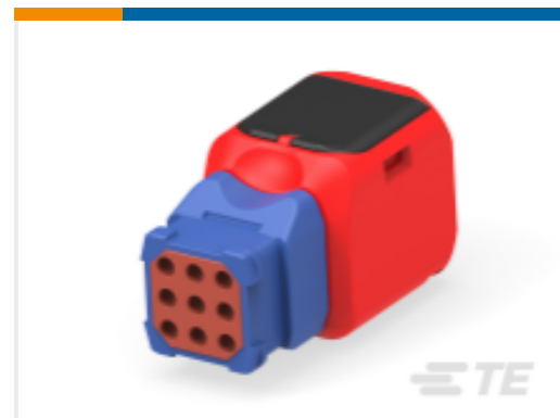
TE Part # D369-P99-NP1 Rectangular Connectors: 9-Way Plug