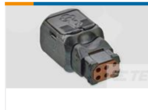
TE Part # D369-R66-NP1 369 6 WAY REC, CRIMP, PIN