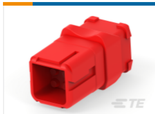
TE Part # D369-R99-NS1 Rectangular Connectors, 9 Way Receptacle