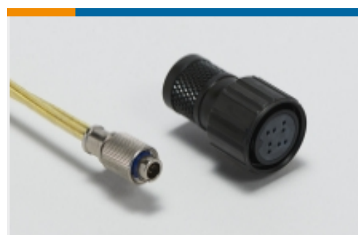
Standard Circular Connectors(9203)