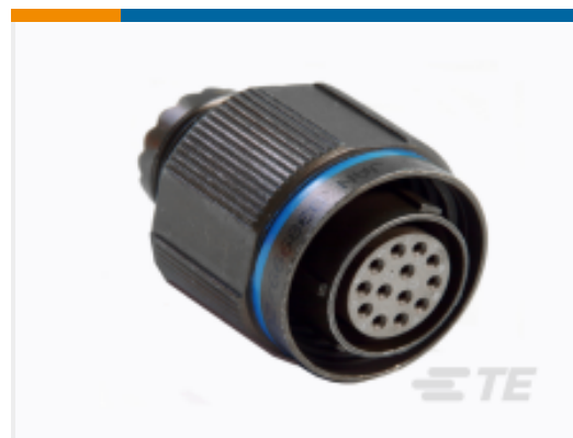
TE Part # CAT-D38999-DTS23V D38999: Straight Plug, 15-35 Insert