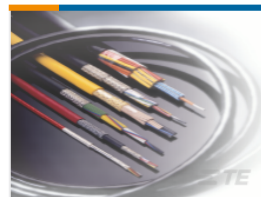
TE Part # 3665183001 100G0111-1.50-0CK0226