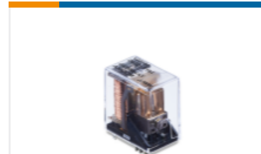
TE Part # 6-1393809-5 Signal Relays: 5 Amp, Monostable DC