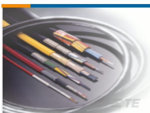
TE Part # CQ20563001 100G0111-0.50-9CK0226