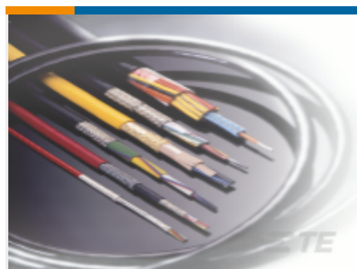
TE Part # E661373001 100G0111-1.00-0CK0226