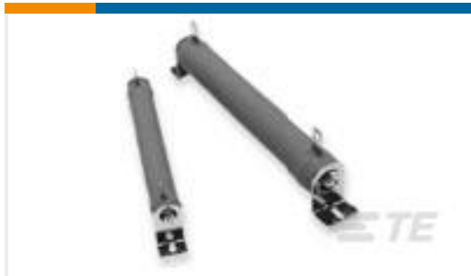
TE Part # 1-1879451-9 TE 600W 33R 5% Bracket