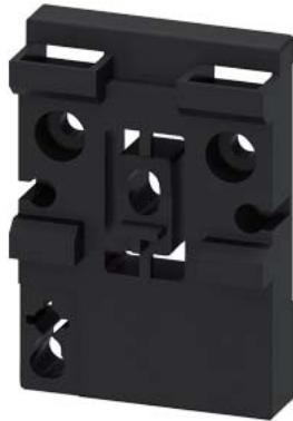
Spacer disc for standard mounting rail adapter for 3RA2