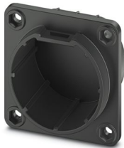
CHARX connect, Charging connector holder, Accessories, for vehicle charging connectors on charging stations (EVSE), GB/T, GB/T 20234.3, Front mounting, housing: black

Please be informed that the data shown in this PDF document is generated from our online catalog. Please find the complete data in the user documentation. Our general terms of use for downloads are valid.