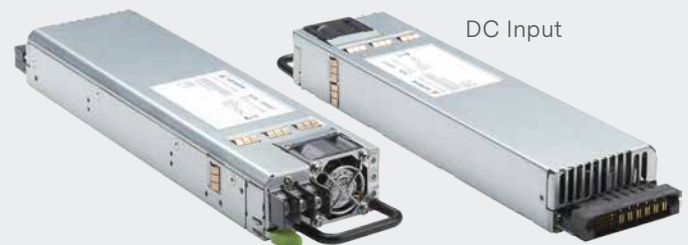
Connector input shown

Advanced Energy's Artesyn DS450DC and DS550DC series bulk front end power supplies are the DC-input versions of their DS450 and DS550 AC-input counterparts. Mechanically identical to the AC versions, these products allow system operation from a Telco style 48 Vdc input. Rated at 450 and 550 watts, the DS450/550 power supplies generate a main DC output of 12 Vdc and a 3.3 Vd for powering standby circuitry. Standard features include active current sharing, internal ORing FETs and an EEPROM for storing service data to facilitate efficient field replacement. An I 2 C communication interface is provided for the FRU EEPROM data.