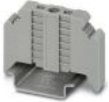
End clamp, width: 9.5 mm, color: gray