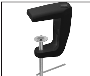
Heavy-Duty Mounting Clamp