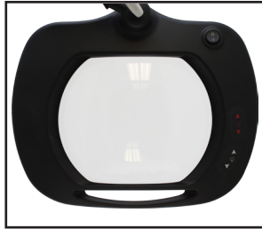
7.5 Inch x 6.2 inch / 5 Diopter Lens 2.25x Magnification