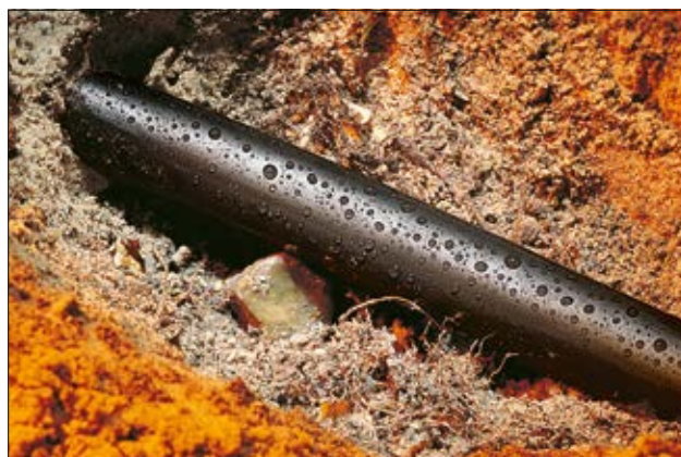
TREDUX HA47 - application below ground.