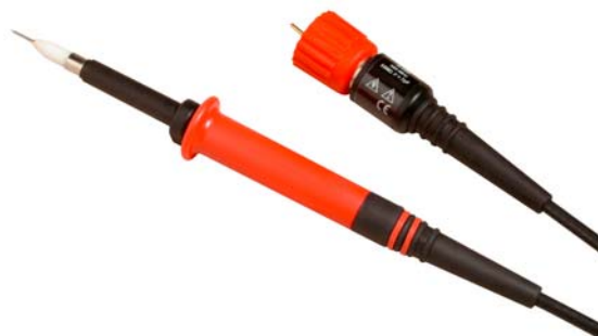
Model 6498 1000V CAT II Passive Oscilloscope Probe