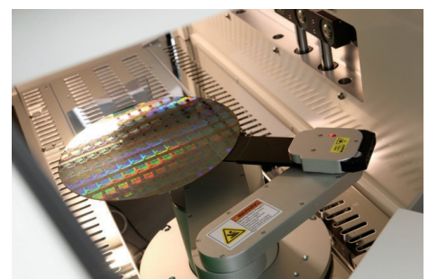
Semiconductor Wafer Assembly