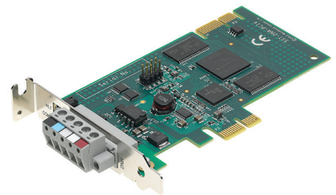
DN4 DeviceNet PCIe Card Series 112113