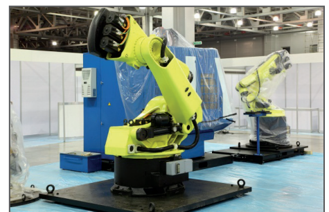
Automotive Robot Controller