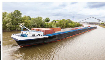
SHIP POWER SYSTEMS