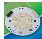
LED Down Lighting