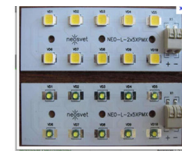
LED Strip Lighting