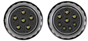
6 Pole (5+PE) and 8 Pole (4+3+PE) Faceviews