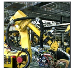
Industrial Automation Assembly Line