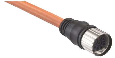
Brad® M23 Power Overmolded Cordset

Resists multiple harsh-environment applications and substances including weld-slag and cutting-oil. Delivers exceptional flexion and torsion performance over a wide operating temperature range