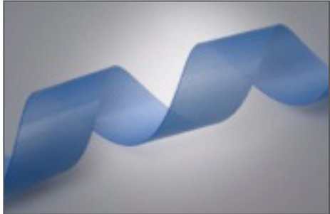
Temp-Flex FEP MIL-Spec Approved Flat-Ribbon Cable