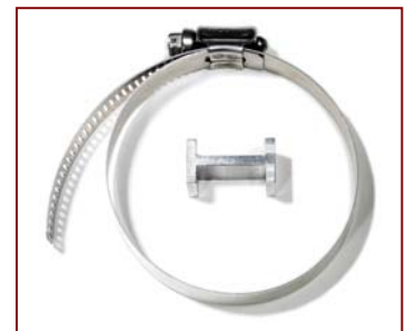
Outdoor Mounting Kit

Specifications subject to change without notice.