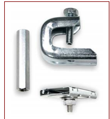
Indoor Mounting Kit

Cut perpendicular to the antenna along the cable axis