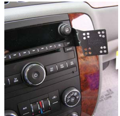
Chevy Tahoe, Suburban 2007

INSTALLATION IS NOW COMPLETE. ENJOY YOUR NEW INDASH by PANAVISE MOUNT.