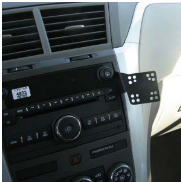
Installation of InDash Mount

INSTALLATION IS NOW COMPLETE ENJOY YOUR NEW INDASH by PANAVISE MOUNT