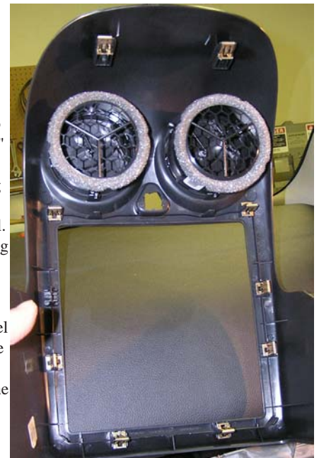
Radio bezel showing clip loca-

INSTALLATION IS NOW COMPLETE. ENJOY YOUR NEW INDASH by PANAVISE MOUNT.