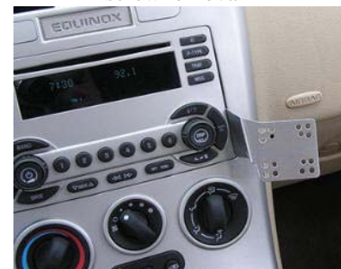
Lower Installation Location

InDash installed showing upper location on new style radio.