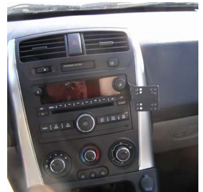
Saturn Vue 2006 Final Installation Picture

STEP #4: Replace the bezel carefully starting from the right side by the Installed Mount. INSTALLATION IS NOW COMPLETE. ENJOY YOUR NEW INDASH by PANAVISE MOUNT.