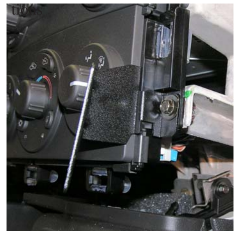
Mount installed showing location