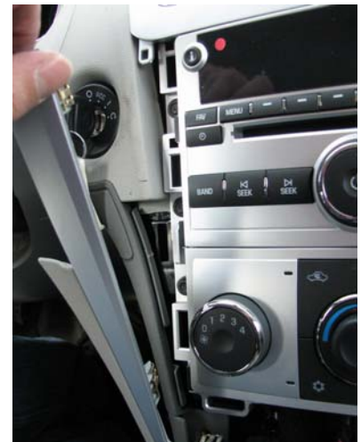
Radio Bezel Removal