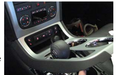
Shifter Console Removal

INSTALLATION IS NOW COMPLETE. ENJOY YOUR NEW INDASH by PANAVISE MOUNT.