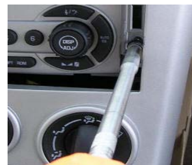
Lower Installation Location screw removal