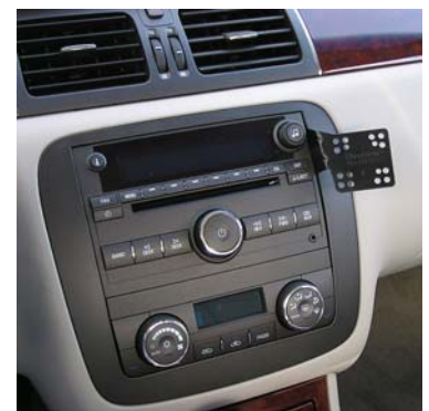
Buick Lucerne 2006 Mount Installed