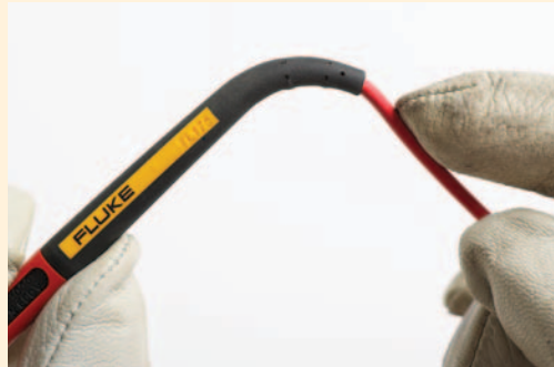
Extreme strain relief tested to withstand over 30,000 bends