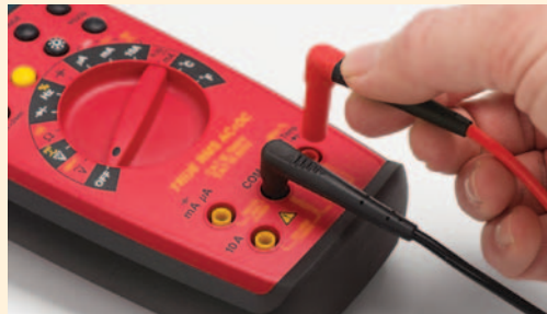
Universal plugs compatible with all 4 mm shrouded inputs