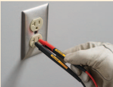
Increase tip exposure for CAT II probing