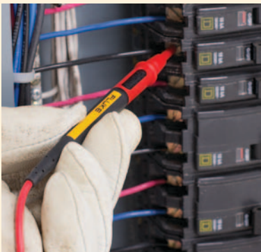
Reduce tip exposure for CAT III testing