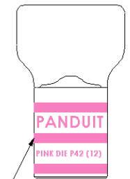
Color coded barrel markings