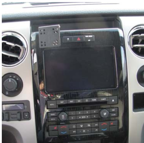
Mount in Place with Mounting Plate in Left Side Down Position on Nav.