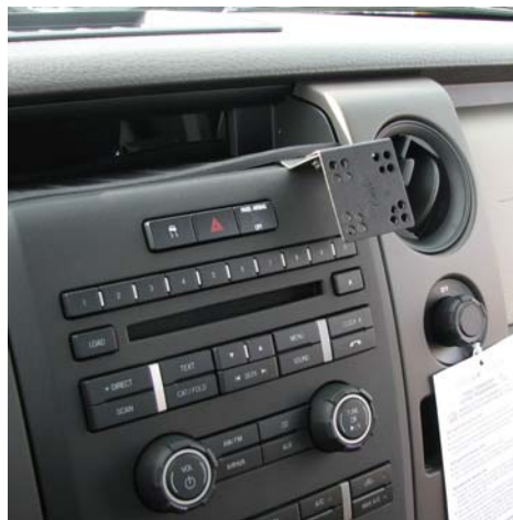
Mount in Place with Mounting Plate in Right Side Down Position