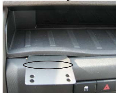
Rubber Mat Cut Area