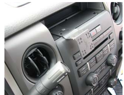
Mount in Place with Mounting Plate in Left Side Down Position