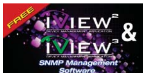
iView: Windows 2000/XP/Vista/Win7

Rate converters employ Auto Negotiation functionality on the twisted pair port for plug-and-play operation, or they can be manually configured for the desired speed and duplex mode.