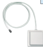
• IO1900 sphere