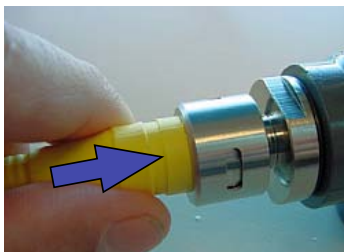
1. Push-to-mate connector