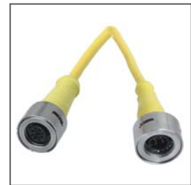
Brad® Ultra-Lock® (M12) EX Connection System for Zone 2 Hazardous Locations

Left: Female Single Ended (Series 120614)