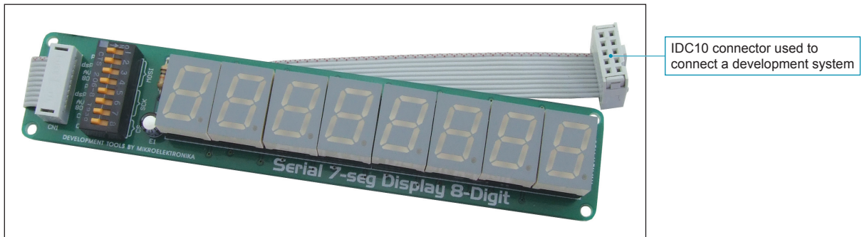
Figure 1: Serial 7-Seg Display 8-Digit additional board

Switches 7 and 8 on the DIP switch SW1 can also be used for connecting the CS pin (Chip Select) on the additional board to a development system. Depending on the development system in use, CS lines will be connected to different I/O port pins. Accordingly, it is necessary to define in the program, to be loaded into the microcontroller, which pins will be used as the CS pin (Chip Select).