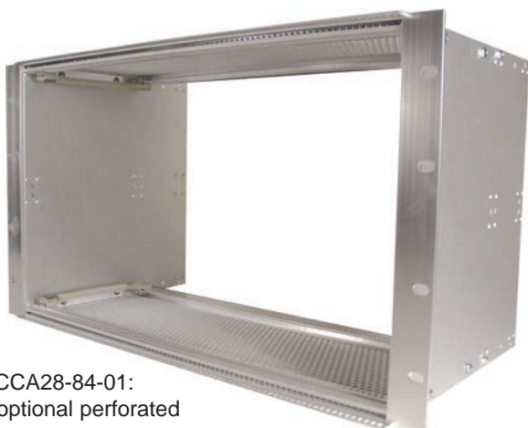
P/N CCA28-84-01: with optional perforated top/bottom covers.

EMC subracks for Compact PCI, VME64X or PXI are available off-the-shelf in assembled or kit form. Standard 19" width or custom sizes available (contact factory). Can accommodate all 3U (single height, 3.937" or 100mm) and 6U (double height, 9.187" or 233.35mm) 0.062" to 0.100" thick boards.