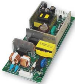
SWF100P-24 100 W