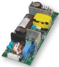
SWF050P-24 50 W