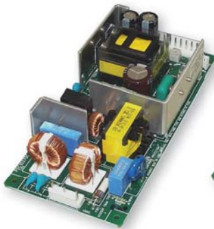
SWF150P-24 150 W