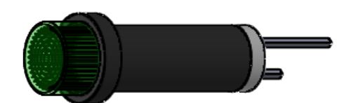
ISOMETRIC VIEW ONLY FOR REF.

The information in this document is the exclusive PROPRIETARY property of VISUAL COMMUNICATIONS COMPANY, LLC . It is disclosed with the understanding that acceptance or review by the recipient constitutes an undertaking by the recipient: (1) to hold this information in strict confidence (2) not to disclose, duplicate, copy, or use the information, in whole or in part, for any purpose other than that for which disclosed