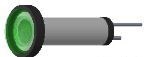
ISOMETRIC VIEW ONLY FOR REF.