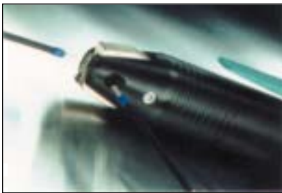
PC 24 - 14 H Close up View

Hand-crimper Trapezoid crimping Side and front insertion Universal - die Range 24-14 AWG (0.25-2.50 mm 2 ) Length: 7.9 inches (200 mm) Weight: 35.2 ounces (1000 g) Pressure: 58 psi (4 bar)