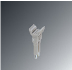
Plug-in bridge, Number of positions: 2, Color: red

Please be informed that the data shown in this PDF Document is generated from our Online Catalog. Please find the complete data in the user's documentation. Our General Terms of Use for Downloads are valid ( http://phoenixcontact.com/download )