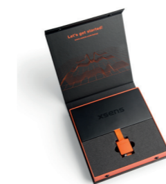
MTi 10-series Development Kit: MTi, software and cabling