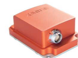
MTi encased: 57x42x23.5 mm, 52g, 9-pins push-pull connector