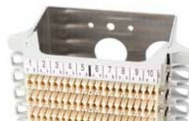
3M™ Label Holder SOR E10 on 3M™ High Density Cross-Connect Back Mount Frame STG2000