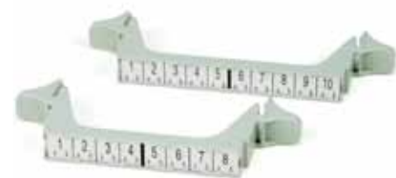
3M™ Label Holders SOR E8 and SOR E10