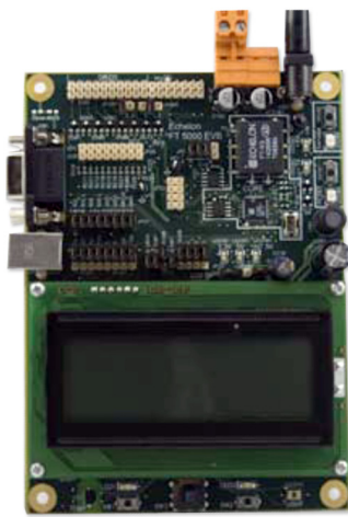
FT 5000 EVB

Mini FX makes it affordable for anyone to understand and harness the power of the popular LonWorks platform, and to develop new devices for the rapidly growing, price-sensitive sensor/actuator mass market. Use Mini FX standalone to create devices that install themselves, or use Mini FX with a network installation tool such as the LonMaker Integration Tool to create devices that are installed in managed networks. If you need a more full-featured development environment, upgrade to the NodeBuilder FX Development Tool, which uses the same Neuron C programming language, includes the LonMaker Integration Tool, and also includes many productivity enhancements such as a debugger, project manager, integrated development environment, code editor, code wizard, plug-in framework, and network management API.