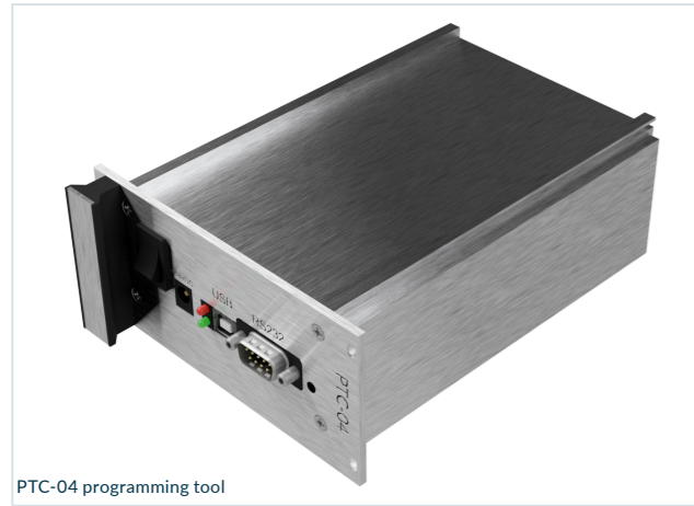
PTC-04 programming tool

Communication is done through a standard RS-232 null modem cable to a COM port of the PC or via USB. The PC requires no custom configuration, allowing the programmer to be used with any PC with a COM port speed of 115.2kbs or a standard USB 1.1 or USB 2.0 (Type A) interface.