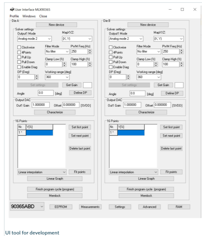
UI tool for development