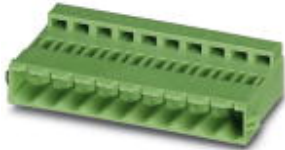
The illustration shows a 15-position version

Plug component, Nominal current: 12 A, Rated voltage (III/2): 320 V, Number of positions: 4, Pitch: 5.08 mm, Connection method: Crimp connection, Color: green, Corresponding male crimp contacts with current [A] and conductor cross section range [mm²] data: 10A/ICC-MT 0,5-1,0 (3190577); 10A/ICC-MT 0,5-1,0 BA (3190603); 12A/ICC-MT 1,5-2,5 (3190580); 12A/ICC-MT 1,5-2,5 BA (3190593). BA = Bandkontakte