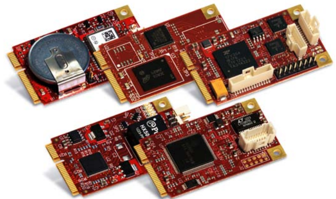
Mini PCIe Modules