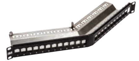
3M™ Angled Copper Patch Panel 1RU, 24-port