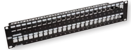
3M™ Copper Patch Panel 2RU, 48-port