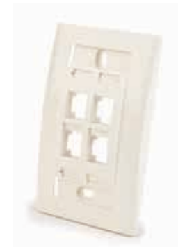
3M™ Wall Outlet with 3M™ Modular Adapter 8687 SC Inserts

3M™ Faceplates are compatible with single-gang electrical wall boxes and are available in 2-port and 4-port versions. These faceplates are convex in shape and are compatible with 3M™ RJ45 Modular Jacks. Port icons for port identification as well as label windows are included. Available in office white and bright white. The 3M™ Modular Outlet 8686 can accommodate one 3M RJ45 modular jack, as well as four SC fiber adapters or two fiber splices.