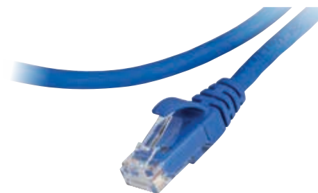
3M™ Copper Patch Cord

3M Copper Patch Cords help enable you to complete your channel to Category 6 (ANSI/TIA 568-C.2 and class E ISO 11801/EN50173). They are constructed with UTP stranded cable, PVC CM rated jacket and snagless latch to ensure durability. These patch cords are available in a variety of lengths and colors for easy cable management and administration.