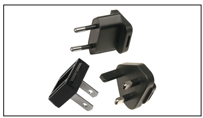
Figure 2. Interchangeable power adapter plugs included with the Mini Zero Volt Ionizer 2