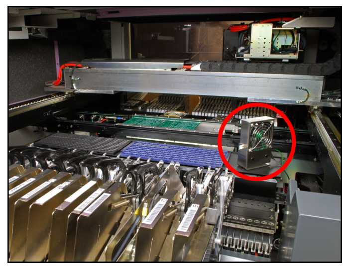
Figure 5. Using the Mini Zero Volt Ionizer 2 inside automated machinery.