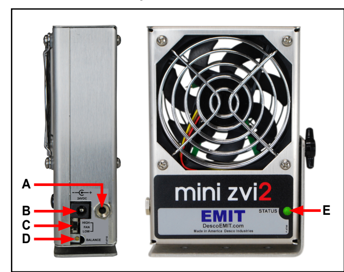
Figure 3. Mini Zero Volt Ionizer 2 features and components

A. Ground Jack: Insert the banana plug end of the included ground cord to this jack. Connect the ring terminal end of the cord to equipment ground.