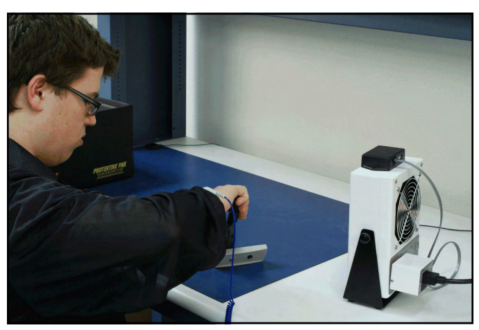
Figure 4. Using the Ionizer Motion Sensor with the <u>60505</u> High Output Benchtop Ionizer

Leave the sensor's field of view to activate the shutoff delay timer. The Ionizer Motion Sensor's LED will turn off and unpower the ionizer once the preset deactivation delay time is reached.