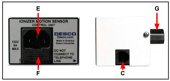
Figure 3. Control Unit features and components

A. Power LED: This LED will illuminate blue when an operator or object has activated the device.