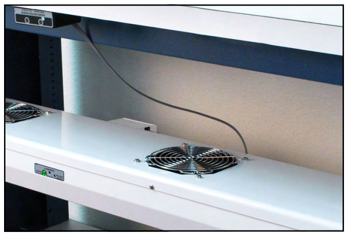
Figure 5. Using the Ionizer Motion Sensor with the <u>60473</u> Chargebuster® 3-Fan Overhead Ionizer