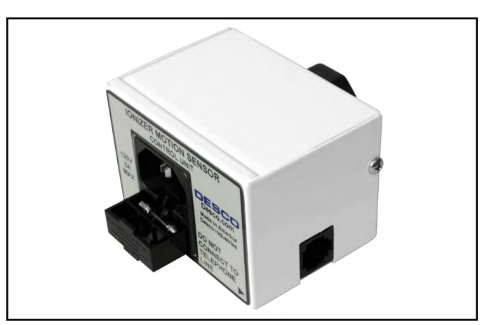
Figure 6. Replacing the fuse in the Control Unit

The fuse located in the Control Unit may be replaced by removing the power cord and opening the fuse drawer at the IEC inlet. The Control Unit uses one 5A, 250V slow blow fuse. DO NOT use other ratings as it may pose a safety hazard.