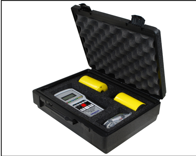
Figure 2. Desco 19787 Digital Surface Resistance Meter Kit