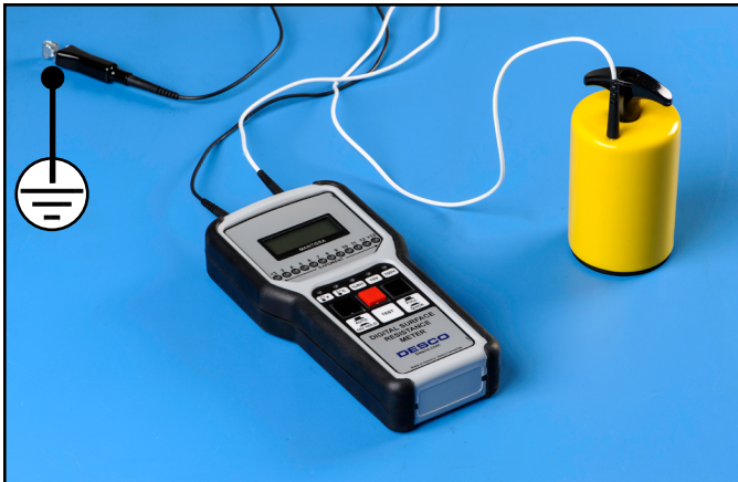
Figure 5. Rtg test setup

If the measurement is outside acceptable limits, clean the surface with an ESD cleaner containing no insulative silicone such as Reztore™ Antistatic Surface & Mat Cleaner , and re-test to determine if the cause of failure is an insulative dirt layer or the ESD worksurface material.