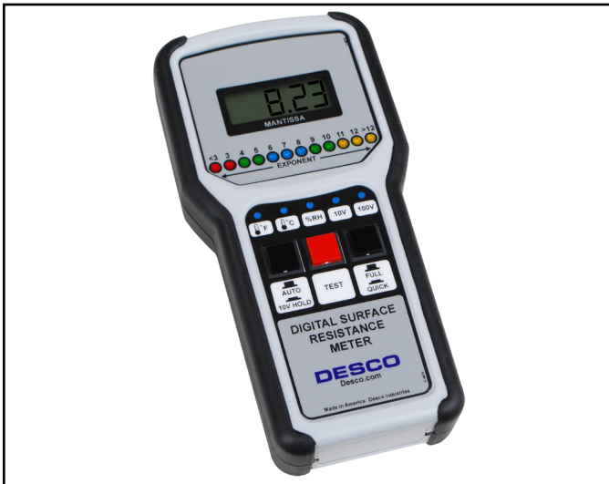
Figure 3. Desco 19788 Digital Surface Resistance Meter