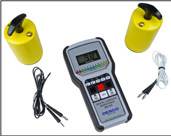
Figure 1. Desco Digital Surface Resistance Meter Kit