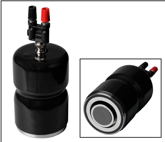
Figure 7. Desco 50005 Concentric Ring Probe

The Desco 50005 Concentric Ring Probe is an instrument to be used in conjunction with a resistance meter, such as the Desco 19787 Digital Surface Resistance Meter, to measure surface resistance per ANSI/ESD STM11.11 the test method listed in Packaging standard ANSI/ESD S541 for surface resistance of planar materials.